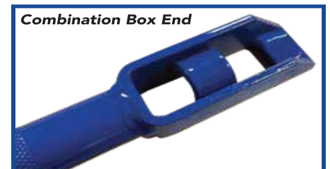
Combination Box End