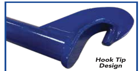
Hook Tip Design